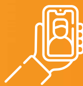
Selfie Technology to Verify Identity