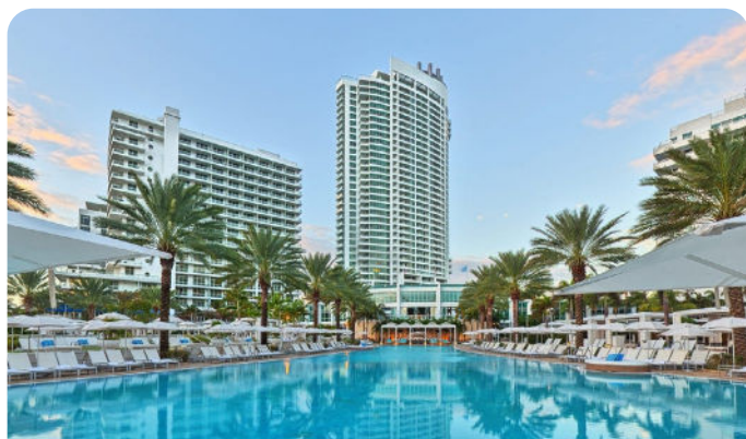
Fontainebleau Miami Beach in Miami, Florida

Advance your business prospects at one of the industry's largest gatherings of executive-level decision makers.